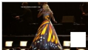
Carrie Underwood Grammy Dress: Designer Reveals Secrets