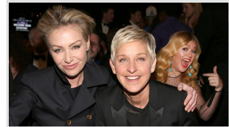
View: Kelly Clarkson Photobombs at The Grammys