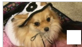
Westminster Dog Show 2013: Hotel Pennsylvania Preps for Pooches