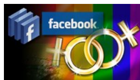
ABC News Photo Illustration

"The whole notion that your information is just about you -- that isn't true